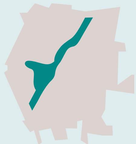
Indicative area of lake and runway grassland